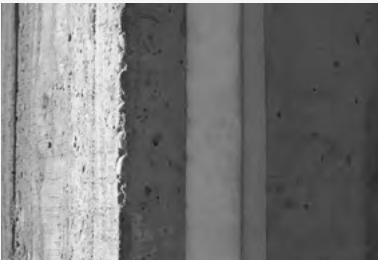
Thermomass Insulated Wall Panels