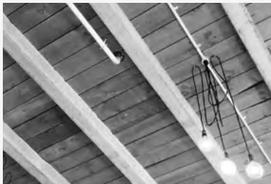
Ribs and Infills