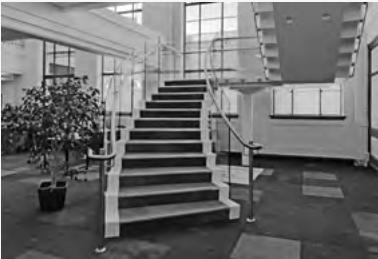
Stairs and Landings